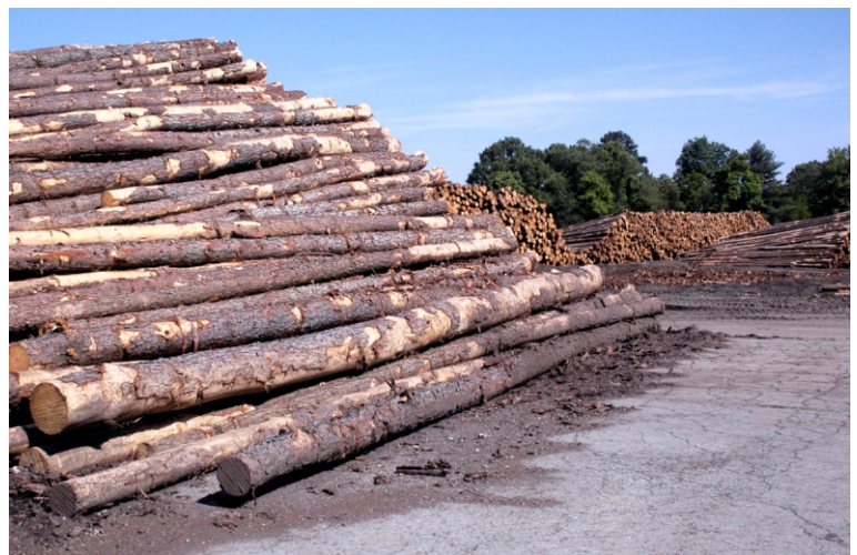
As many as 5,000 of these pine logs pass through the mill on a typical work day.