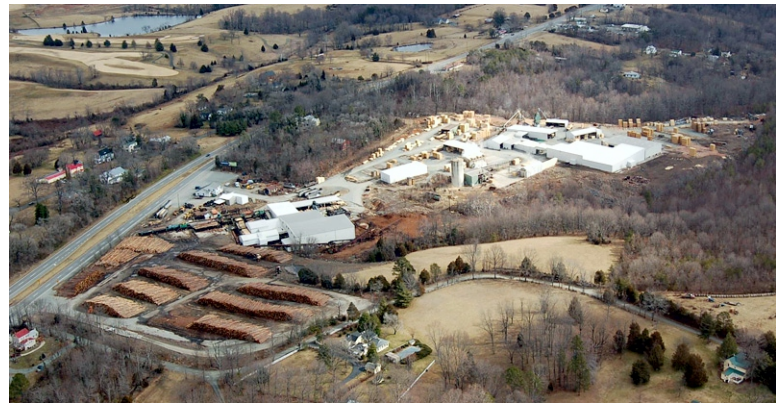
An aerial view of the Yancey sawmill with its supply of logs in the foreground and Route 250 to the left.