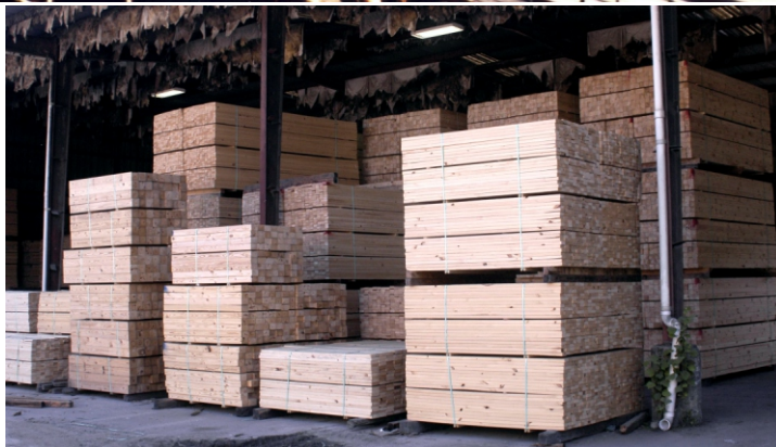
Top, logs being conveyed to a scanner and first cutting. Above, bundled lumber ready for transport to end-users.