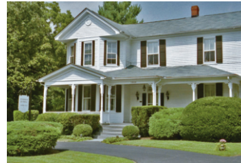
The Anderson Funeral Home.