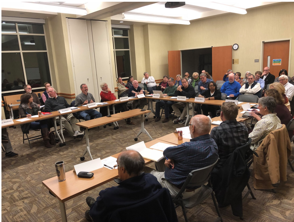
Great crowd for the #CCAC1117 discussion of western park, ReStoreN Station SP, and DCI pic.twitter.com/uGaeNw3LT0